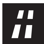
Double basic line