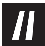
Double basic line