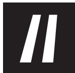
Double basic line