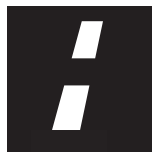
One basic interrupted line