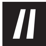
Basic Line (Continuous)